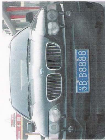
This is a picture car which has a registration number with the number eight in it.

The number of bad luck is number four, which pronunciation is similar to the word "death". In China there are streets which don't have houses with number four or buildings which don't have 4th floor. And the most horrible number is fourteen because it means ten deaths.