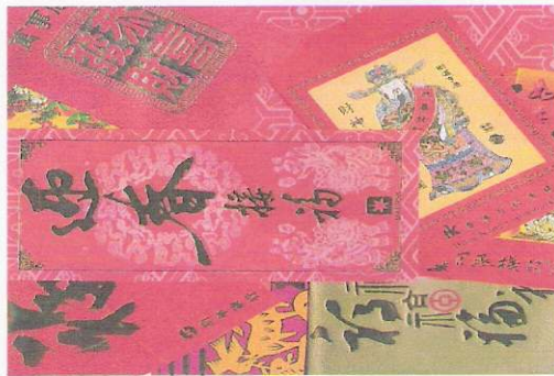
This picture is a red envelope. The red envelope is a monetary gift which is given during holidays or special occasions. The red color of the envelope symbolizes good luck.

The white color is like breast milk color and it symbolizes purity, honesty and welfare.